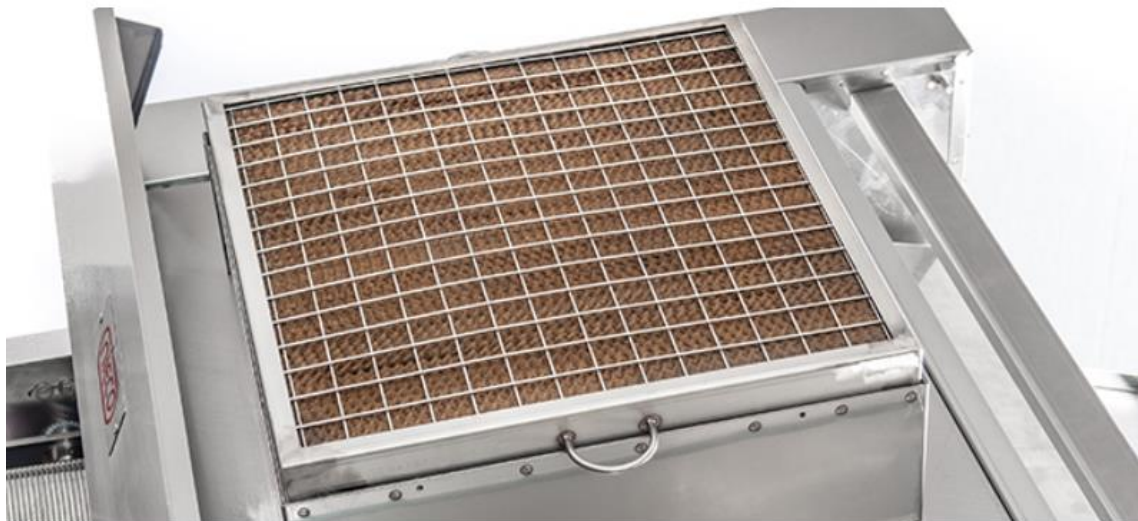
Figure VIII-2 Nieco Incendalyst™