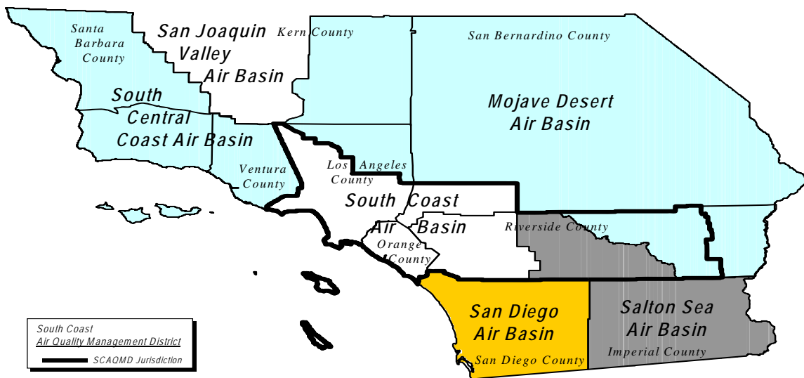
Figure 1-1 Boundaries of the South Coast Air Quality Management District

Riverside and San Bernardino counties), and the Riverside County portions of the Salton Sea Air Basin (SSAB) and Mojave Desert Air Basin (MDAB). The Basin, which is a subarea of the SCAQMD's jurisdiction, is bounded by the Pacific Ocean to the west and the San Gabriel, San Bernardino, and San Jacinto mountains to the north and east. It includes all of Orange County and the nondesert portions of Los Angeles, Riverside, and San Bernardino counties. The Riverside County portion of the SSAB is bounded by the San Jacinto Mountains in the west and spans eastward up to the Palo Verde Valley. The federal nonattainment area (known as the Coachella Valley Planning Area) is a subregion of Riverside County and the SSAB that is bounded by the San Jacinto Mountains to the west and the eastern boundary of the Coachella Valley to the east (Figure 1-1).