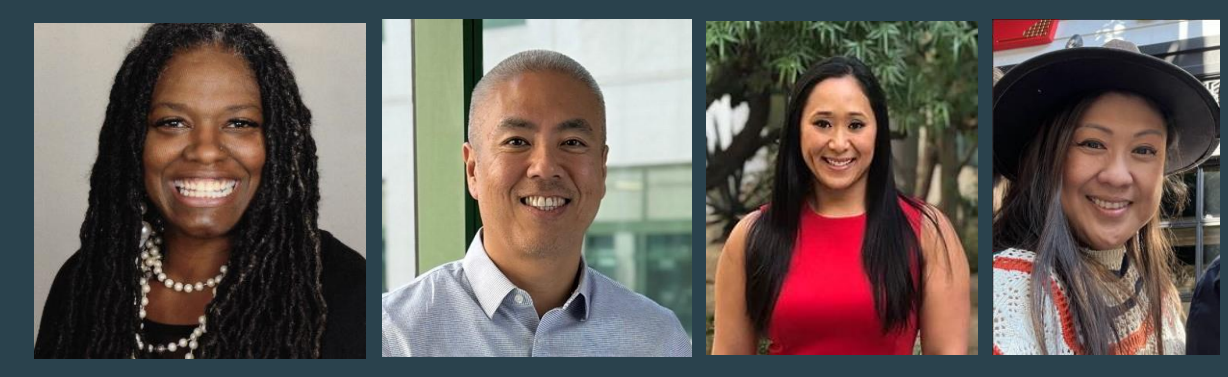
Diversity, Equity, Inclusion with Community Air Program (DEI+CAP) Leadership