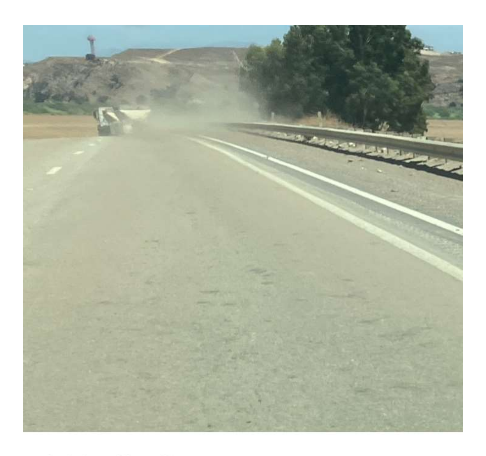
Add a Caption