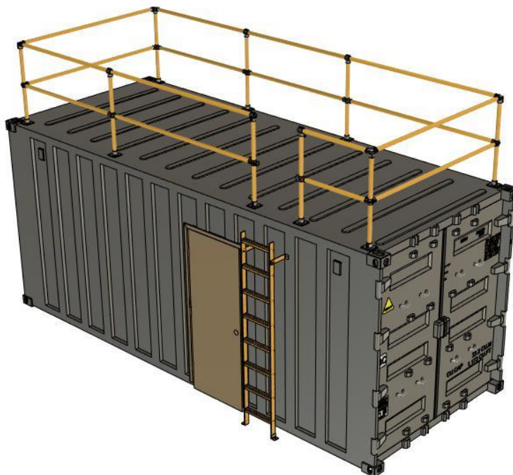
Figure: Conceptual representation of rooftop safety railing and ladder for a 20 X 9 X 9 ft container. Note that the actual configuration and location of the safety system may vary from site to site.

The safety railing and ladder installation are expected to comply with all applicable OASHA standards. The ladder component is expected to have a lockable cover, or other means to secure access to the container's roof. The roof-top safety railing system should be constructed in a way that it can be removed if the air monitoring container has to be relocated.