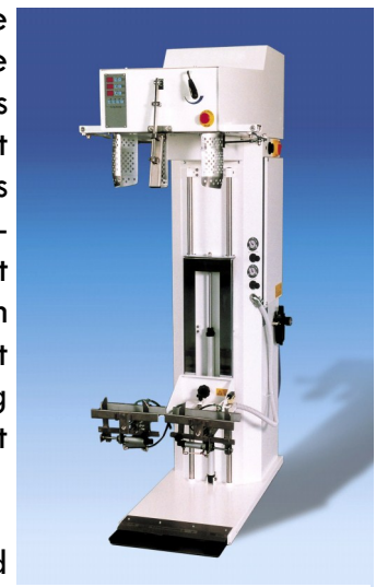
Tensioning Pants Topper

Wet cleaned garments can be finished using either conventional pressing equipment or specialized tensioning finishing equipment. Tensioning presses are designed to reverse or prevent shrinkage and/or seam crumbling and creasing of garments by applying widthwise and lengthwise tension on garments during the pressing process. Tensioning finishing equipment is increasingly recognized as an essential component of professional wet cleaning. Performance tests have shown that professional wet cleaning is effective in the actual cleaning of clothes, but that dimensional change (shrinking and stretching) can sometimes be a problem if the cleaner does not use tensioning equipment. In addition, tensioning finishing equipment has been shown to reduce the pressing labor time at professional wet cleaning facilities.