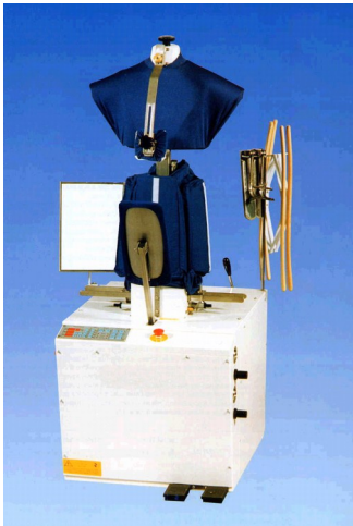
Tensioning Form Finisher

Wet cleaned garments can be finished using either conventional pressing equipment or specialized tensioning finishing equipment. Tensioning presses are designed to reverse or prevent shrinkage and/or seam crumbling and creasing of garments by applying widthwise and lengthwise tension on garments during the pressing process. Tensioning finishing equipment is increasingly recognized as an essential component of professional wet cleaning. Performance tests have shown that professional wet cleaning is effective in the actual cleaning of clothes, but that dimensional change (shrinking and stretching) can sometimes be a problem if the cleaner does not use tensioning equipment. In addition, tensioning finishing equipment has been shown to reduce the pressing labor time at professional wet cleaning facilities.