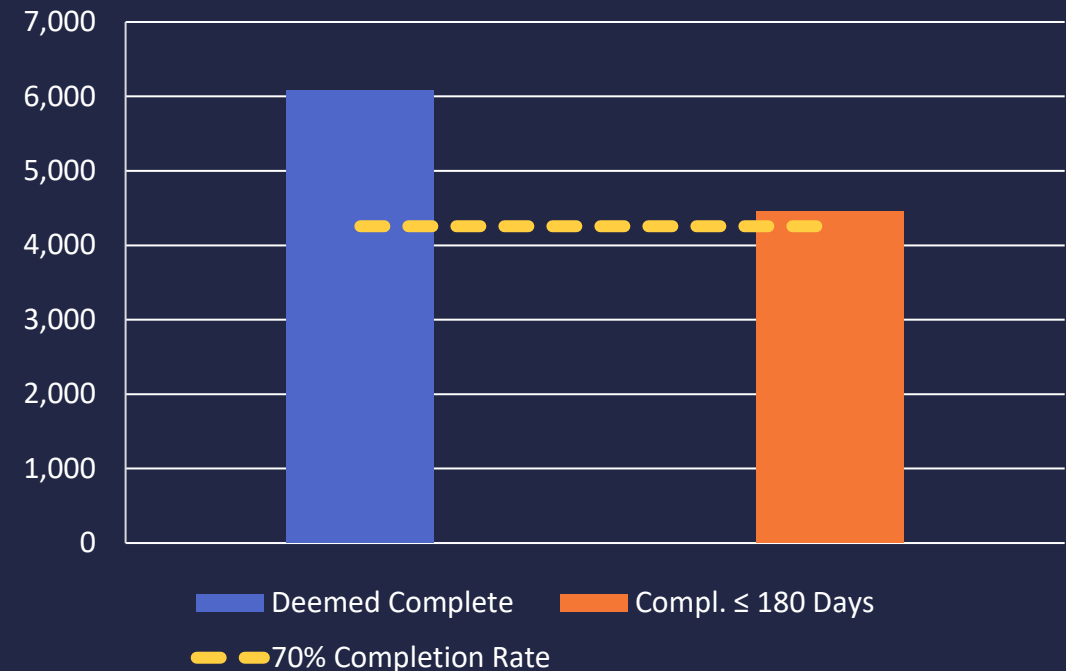
Timely Processing Goal All Applications (FY 2023-24)